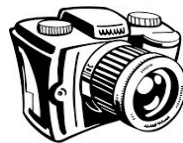
Photo sessions for the new pictorial directory will resume in April. Sign-up sheets for April sessions coming soon!