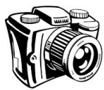
Photo sessions for the new pictorial directory will resume on April 23. Please sign up if you didn't have your picture taken for the new directory. Sign-up sheets are on the information table in the lobby. Please complete the blue information sheet and bring it along with you when you get your picture taken. Extra copies are on the information table.