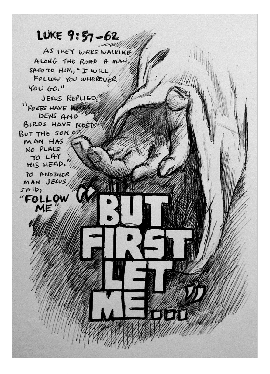
January 19, 2020