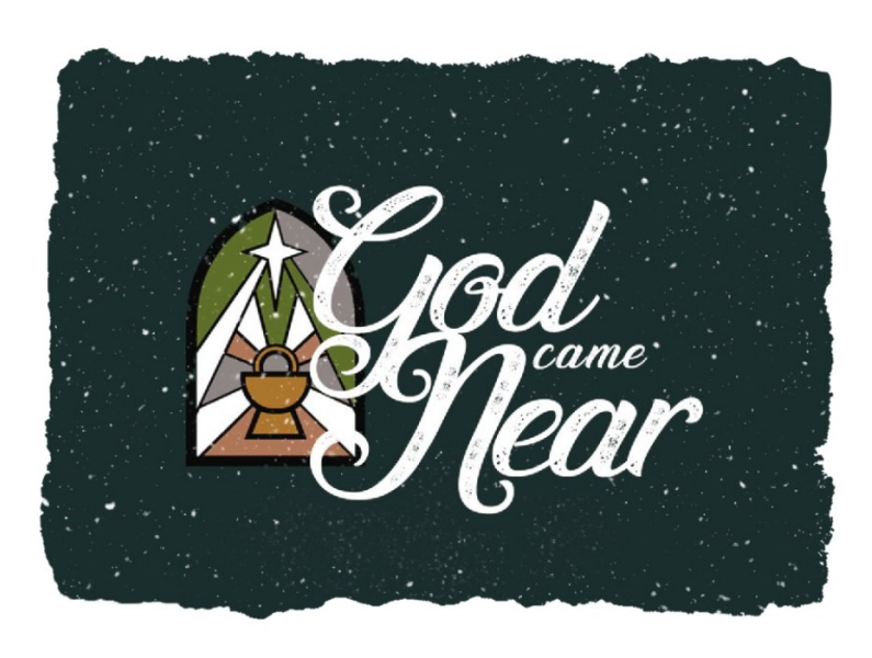
THE THIRD SUNDAY OF ADVENT