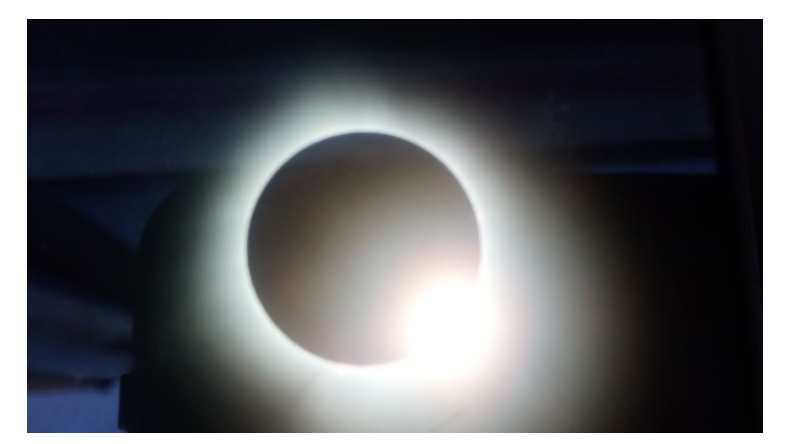
The heavens declare the glory of God; the skies proclaim the work of his hands. Psalms 19:1